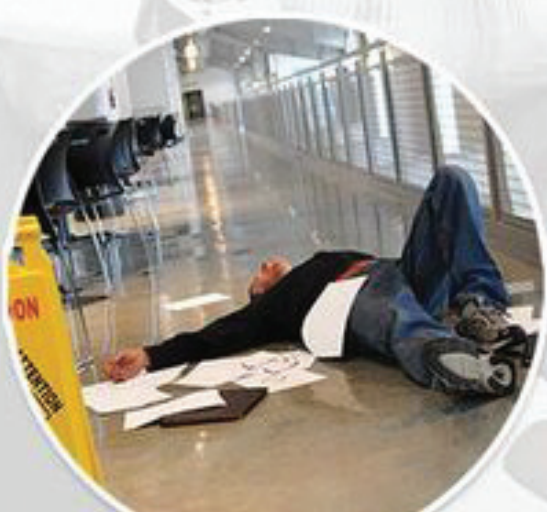
Dramatización. Actor Pagado.